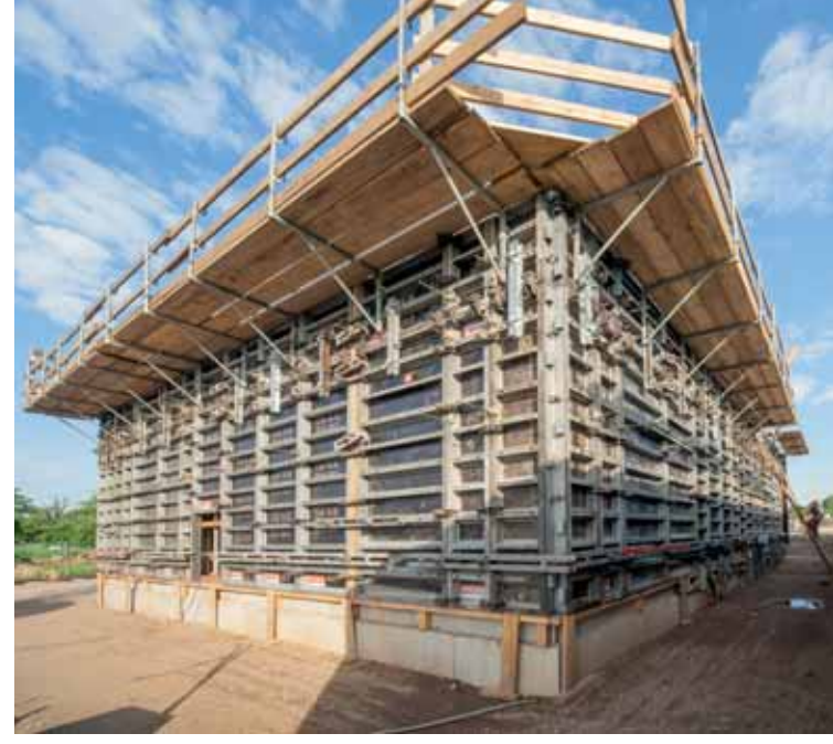
The panels had a max. size of 300 x 512.5 cm, so that 9.60 m long wall segments could be concreted using only 4 formwork panels.