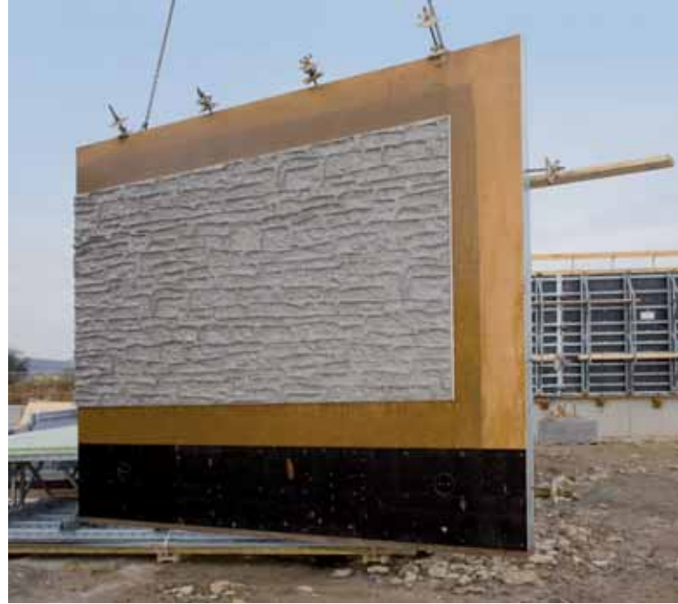
Something only NOE can do: textured formliners and concrete formwork from a single supplier. Delivered to site, ready for immediate use, including the formwork reuse plan and concreting schedule.