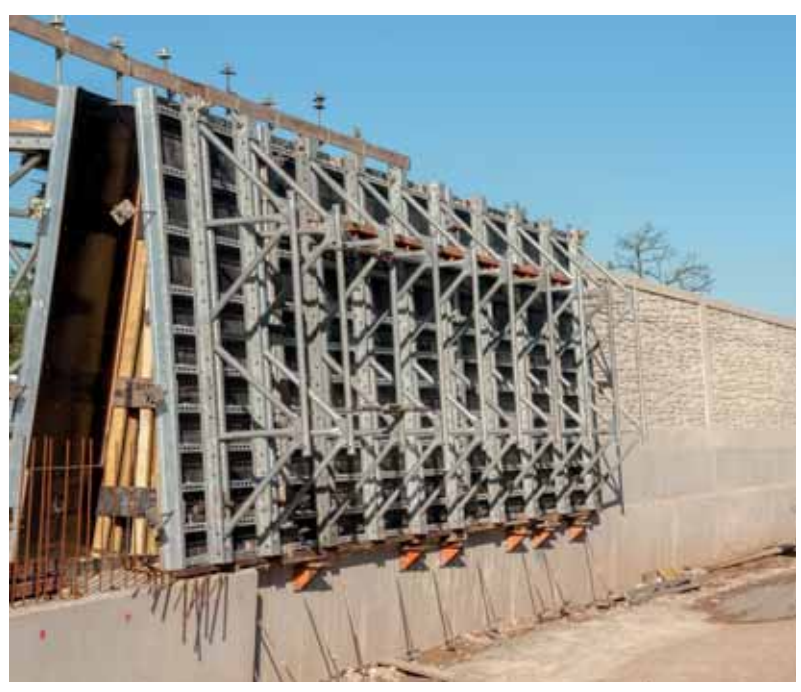
With the NOE Combi 70 system, the ties were placed in the plinth area and above the formwork. There were no ugly tie bar marks in the fair-faced concrete surfaces.