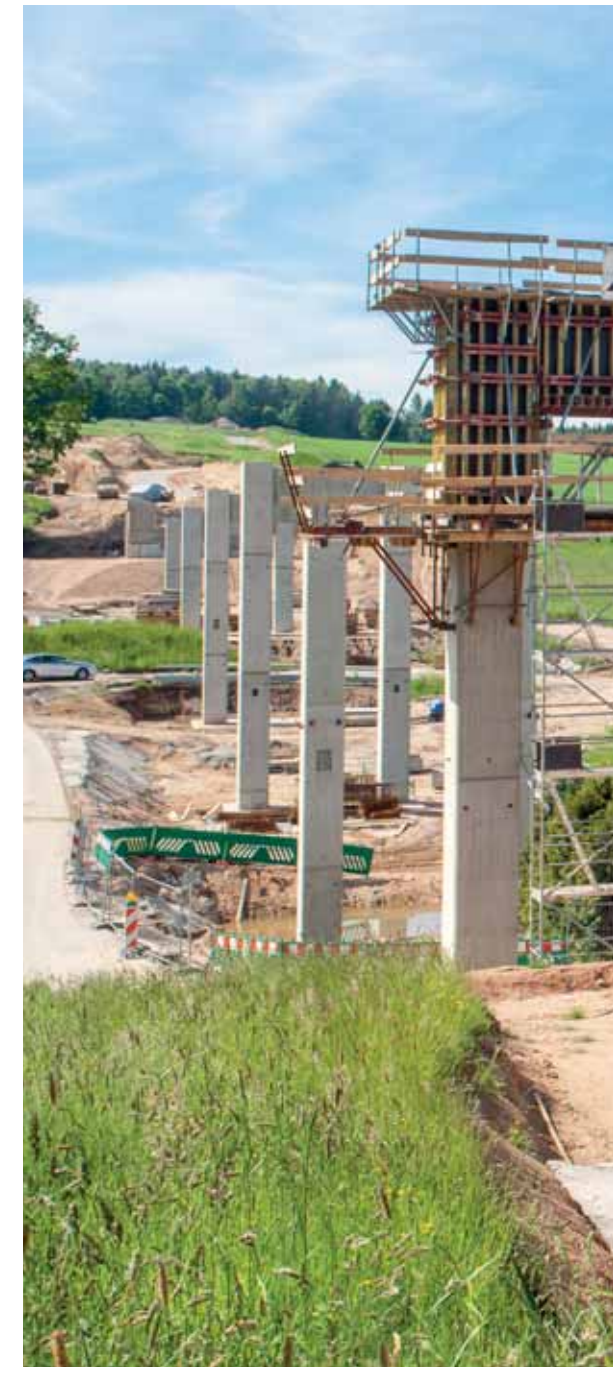
The Kirchberg Bypass crosses the Leutersbach valley on nine pairs of columns up to 16 m high.