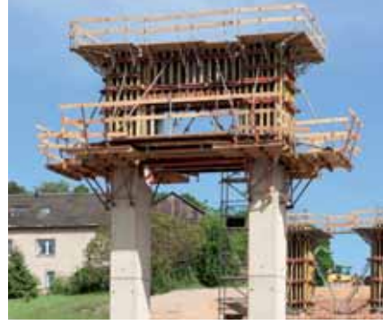
The 25 cm panel width of the NOEratio beam formwork proves itself of particular benefit on the slender cross section of the columns supporting the bridge over the Leutersbach valley.

their tops also had to be cast together with the columns in one pour. As a result of the confined space, the bottom form of the beam had to be light enough to be handled manually. In order for these requirements to be fulfilled efficiently, the main contractor, Arlt Bauunternehmen GmbH, Frankenhain, decided to use NOEratio from NOE-Schaltechnik. This is an extremely flexible beam formwork system specially designed for engineering and system-built structures. It consists of three main elements: steel bracing, NOE H 20 timber beams and NOEform facing. Engineers based in NOE's Cottbus office design the formwork for each project individually to ensure it can be used as efficiently as possible.